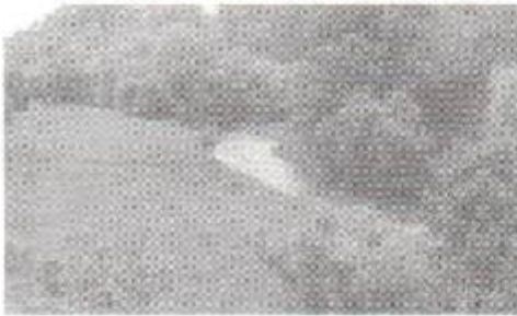
Canfield Creek near Rifle Hill Quarry is normally dry except during heavy rains. After the June 1 storm, it was flowing bank full.