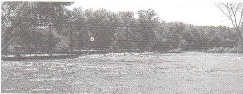
Floodwaters peaked at 16.9 feet at the Historic Forestville Bridge during the July 10th flood. The bridge deck is about 16 feet.