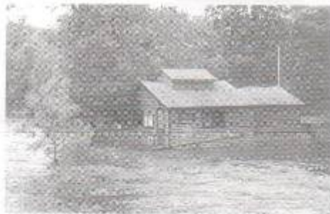
Floodwaters reached the ticket building during both floods and caused damage.