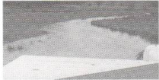
Etna Creek also overflowed its banks. Debris shown here on the County Road 14 bridge and on the fence in the background show how high the water was at its peak.