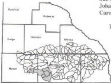
South Branch Root River Watershed Project Area